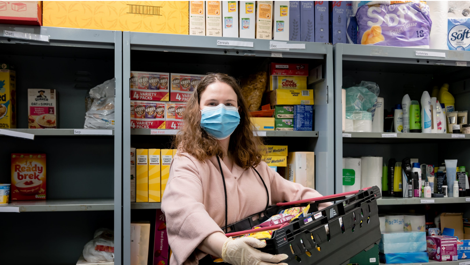
A volunteer at a Trussell Trust food bank