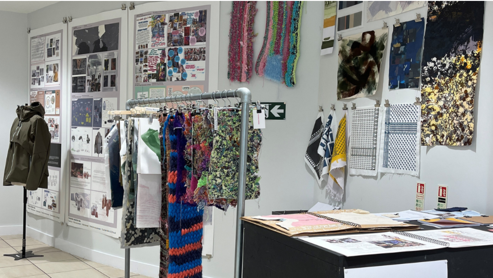
Postgraduate design degree portfolio work on display in the School of Design at Northumbria University