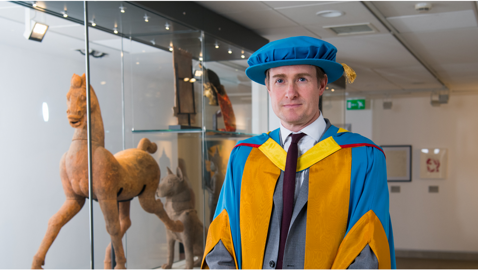
Dr Tristram Hunt in the Woon Gallery of Asian Art at Northumbria