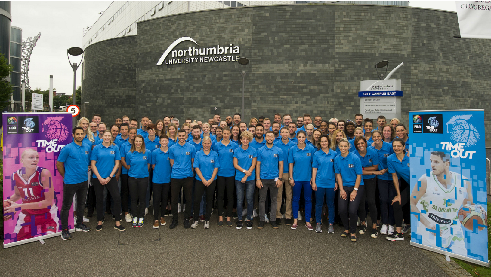
FIBA cohort at Newcastle Business School