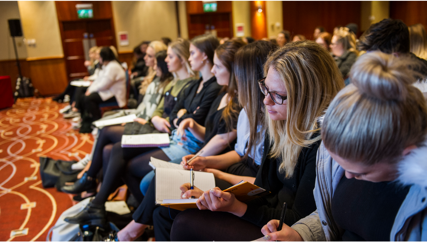
Students at the Future You event at Northumbria University, Newcastle