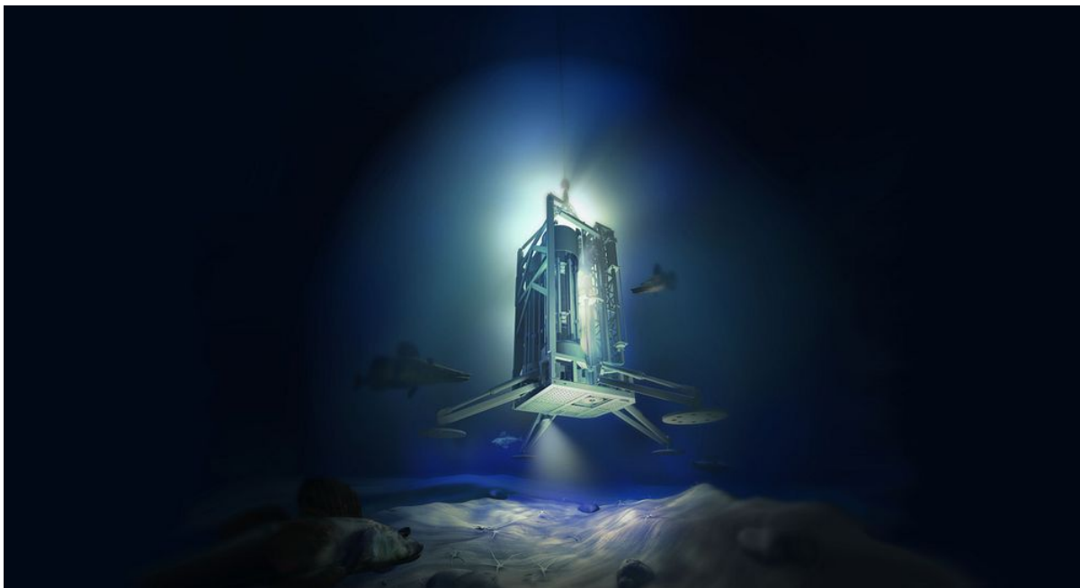
Rendered image of the specialist drilling rig landing on the seafloor of the Amundsen Sea

During the 2017 Polarstern expedition, a specialist seafloor drilling rig retrieved samples of sediment core from 10 metres into the seabed, near Pine Island and Thwaites Glaciers on the Amundsen Sea coast of West Antarctica.