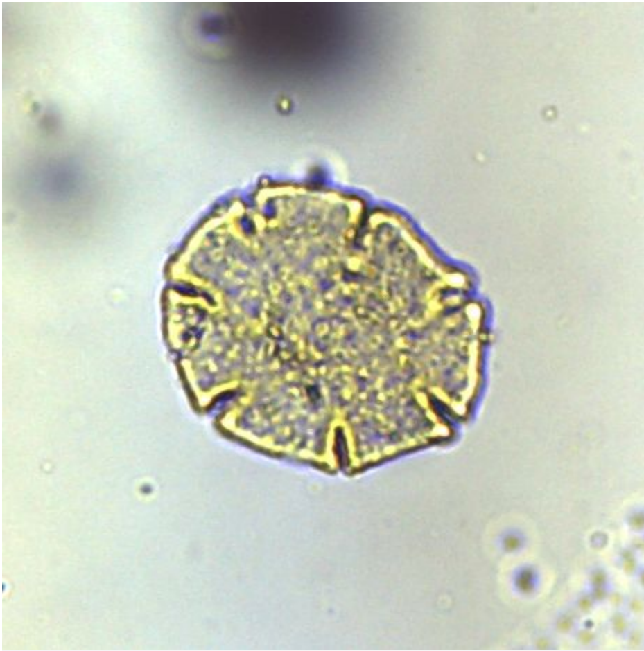
A pollen grain of the southern beech Nothofagus ; the dominant tree during the Early Oligocene

He explained: “Around 34 million years ago, our planet underwent one of the most fundamental climate shifts that still influences global climate conditions today: the transition from a greenhouse world, with no or very little accumulation of continental ice, to an icehouse world, with large permanently glaciated areas.