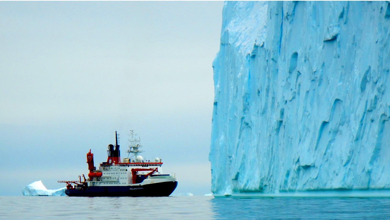
The RV Polarstern in front of a huge iceberg in Pine Island Bay