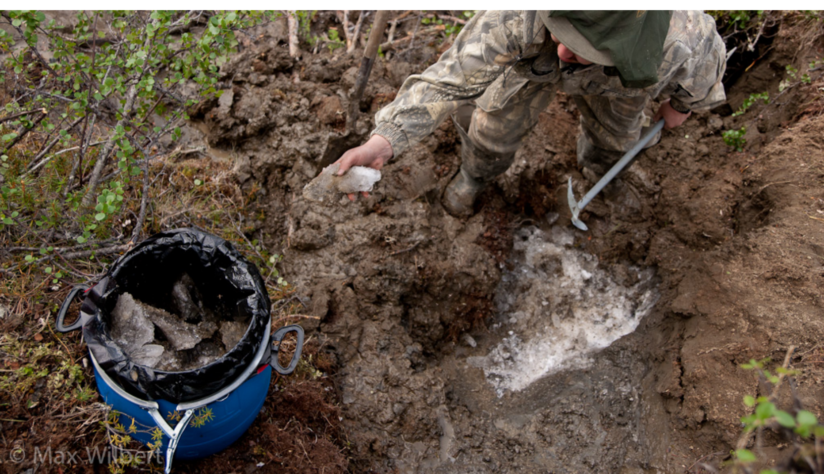
Frozen permafrost under Arctic soils