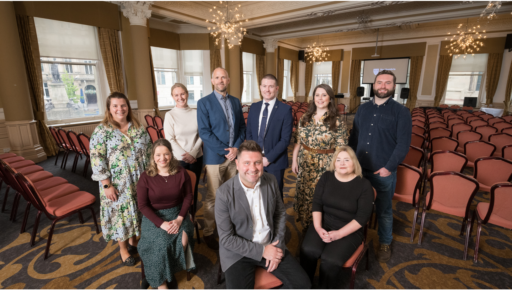
Guest speakers at the ITT Future You Roadshow in Newcastle