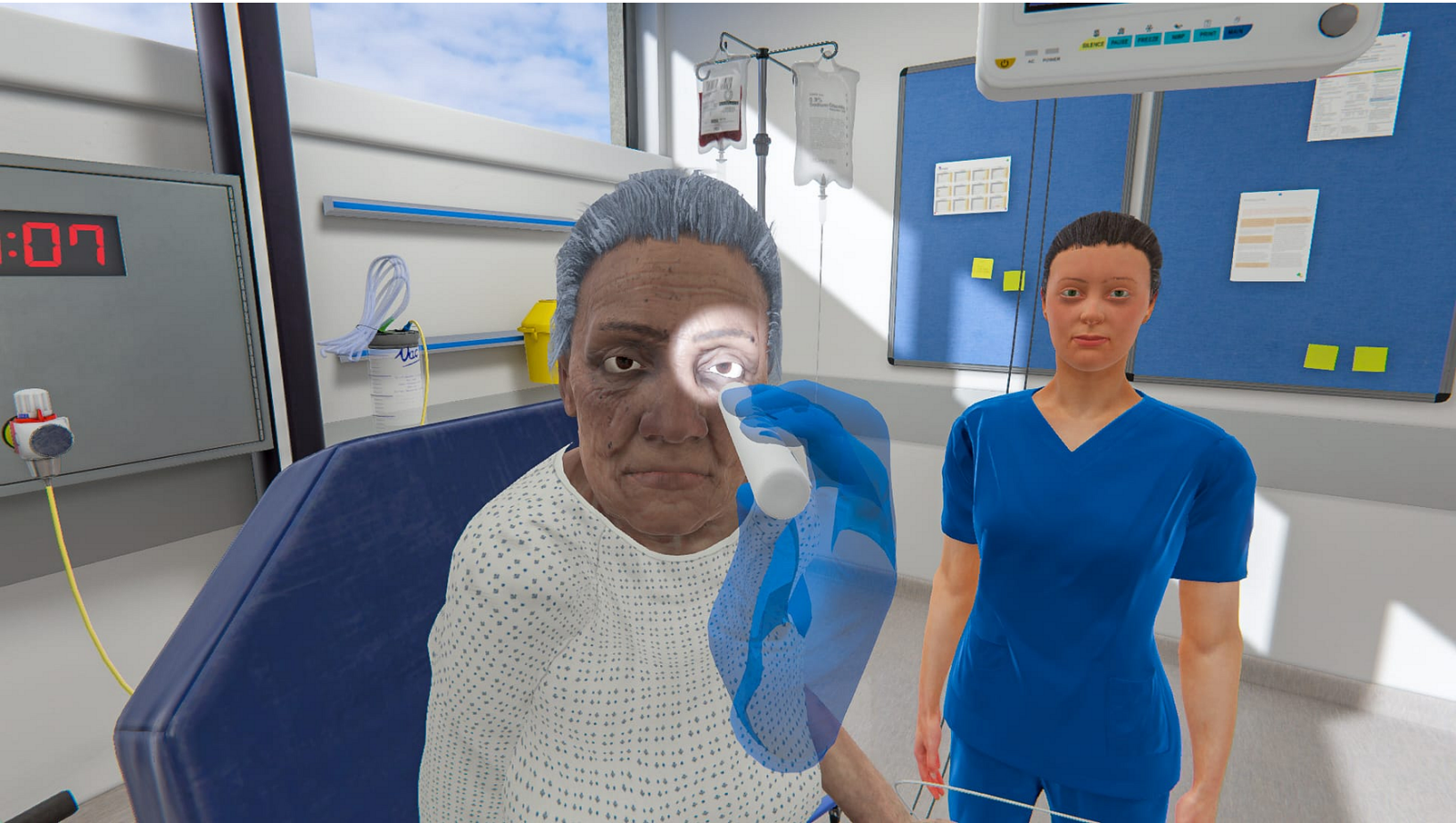
An example of the simulation technologies used in nurse education