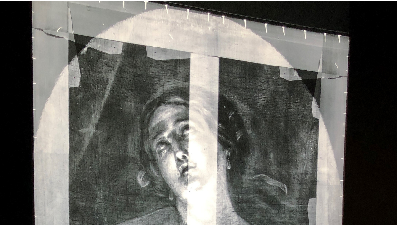
The Death of Lucretia painting at The Bowes Museum