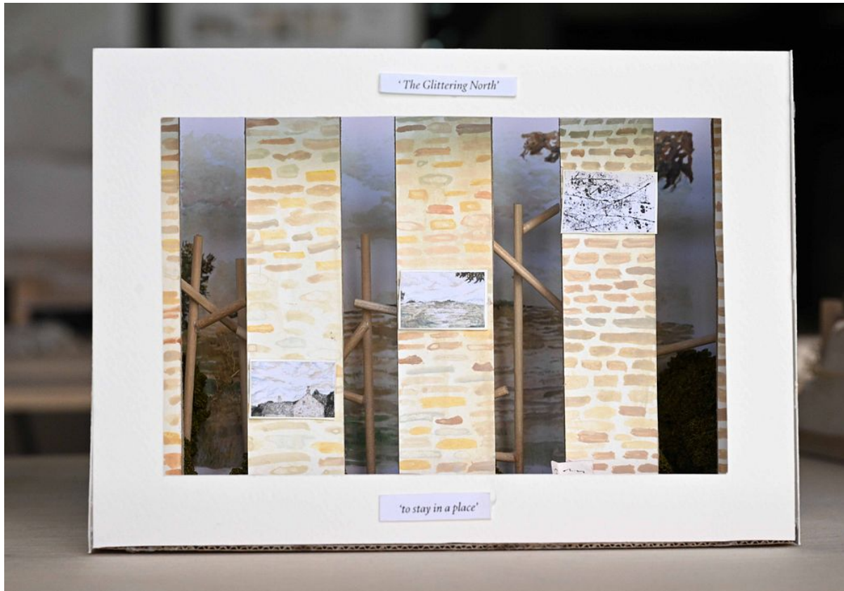
One of Liam’s models, ‘The Glittering North’.

The scholarships are designed to support outstanding architecture students who have the potential to make a significant contribution to the future of the profession. The next round of applications will open in the spring of 2025.