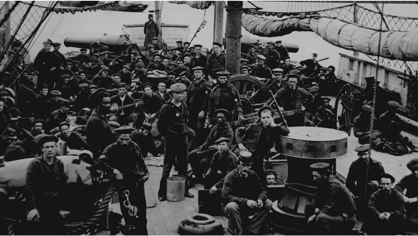
Civil War Bluejackets