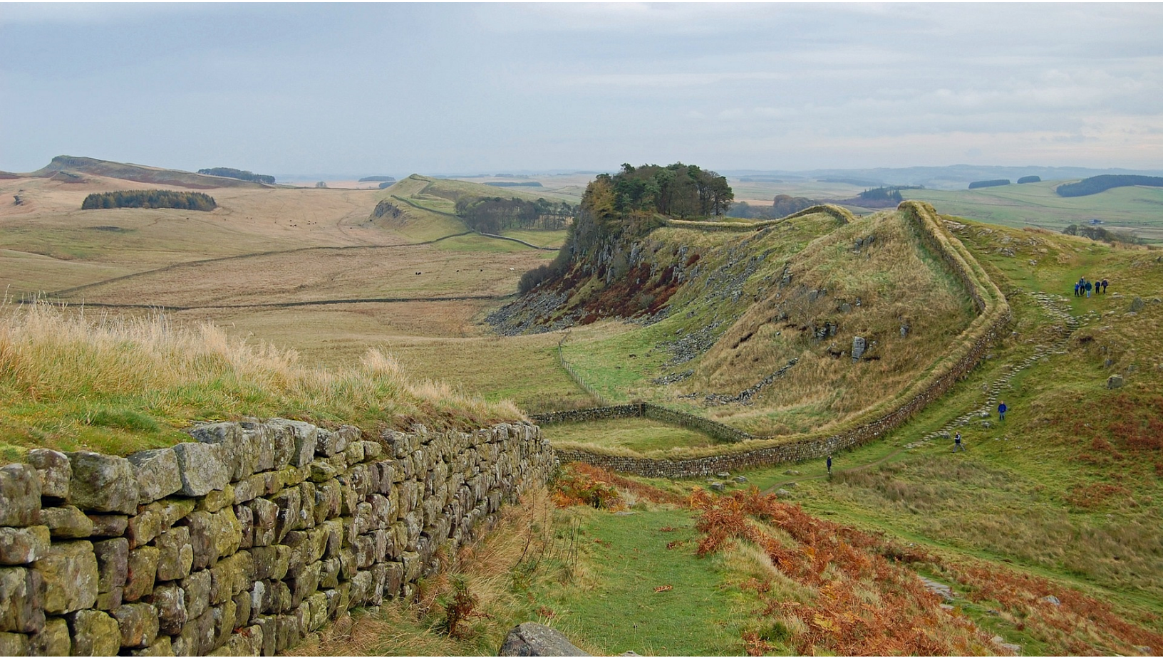
Hadrian's Wall, Northumberland