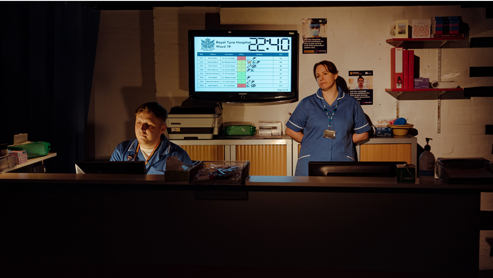
Image from The Nurses' Station performance