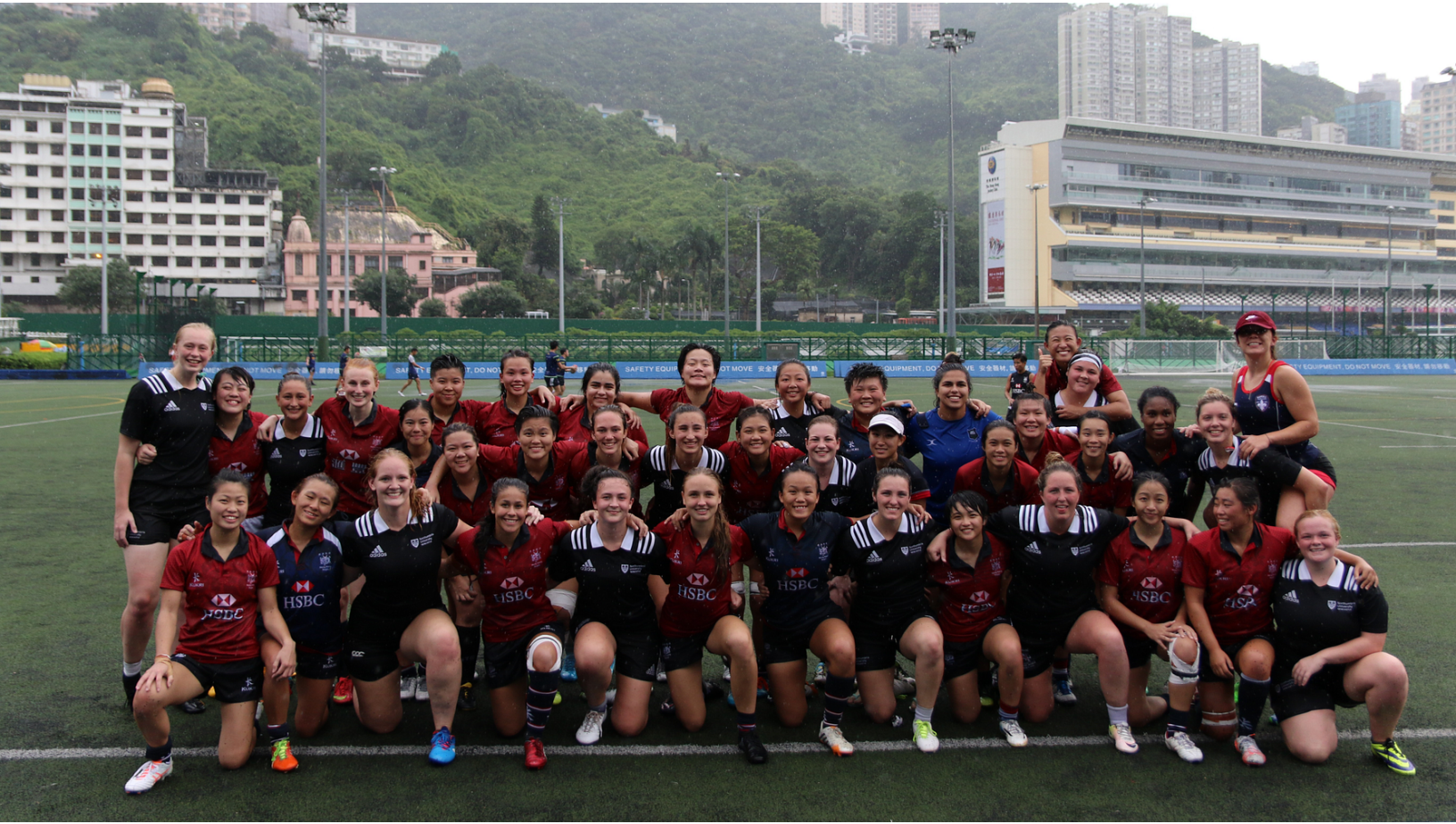
Northumbria University Women's Rugby 1st Team with Hong Kong national squad