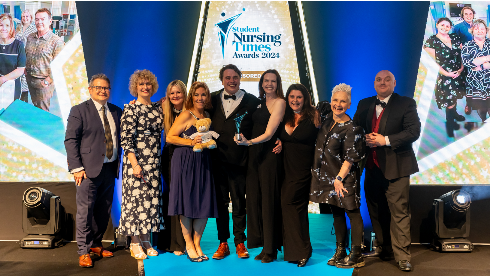
Northumbria University team collecting their award at the Student Nursing Times ceremony