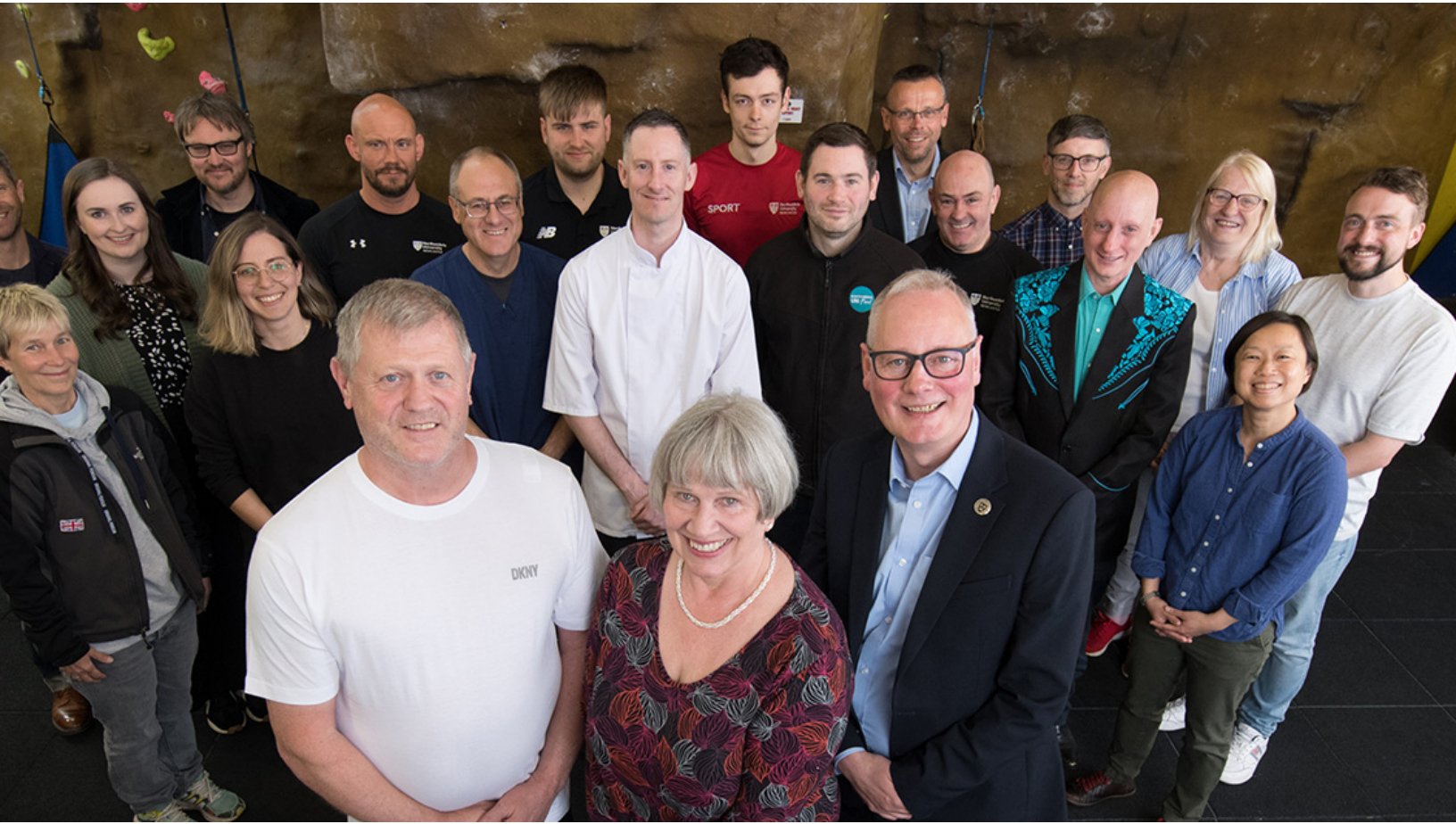
Northumbria University HAF Plus delivery team with partners from Chartwells and Big River Bakery