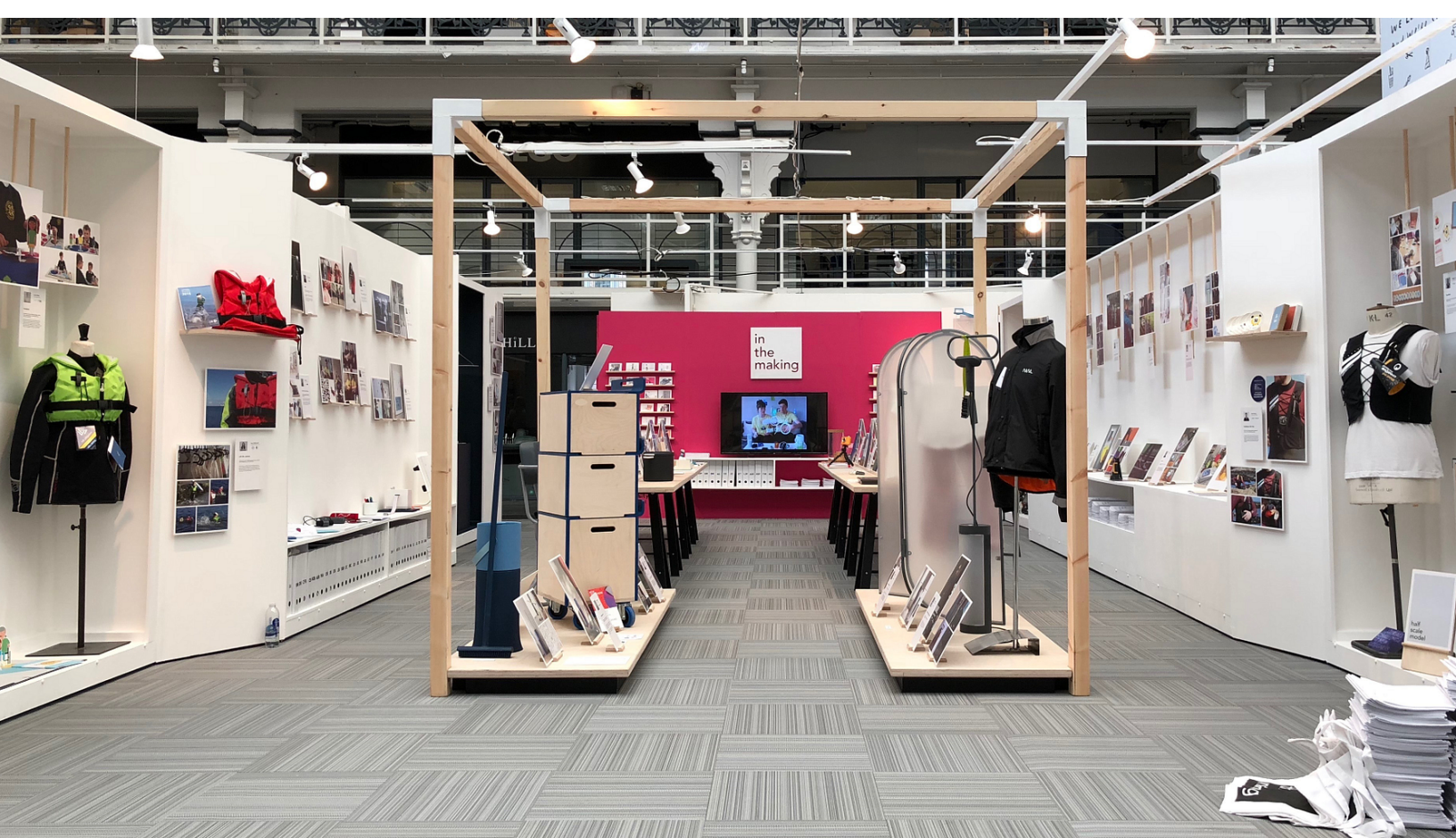
The Northumbria University stand at this year's New Designers exhibition