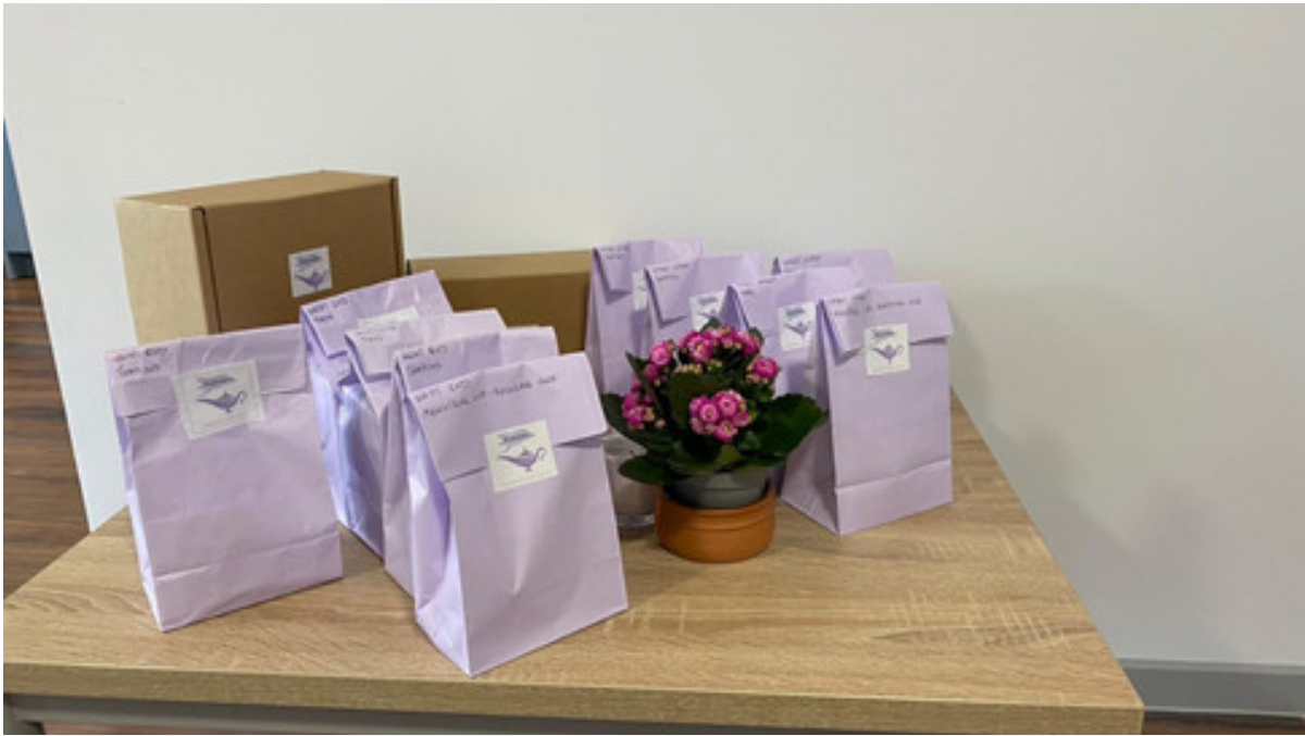
The Hygienie's donation bags of sustainable menstrual products

Eilish from Smart Works commented on donations they have already received, saying: “We always provide women with a goodie bag of beauty and sanitary products to make them feel confident ahead of their interviews. The Hygienie’s hand delivered a brilliant array of sanitary products – including a menstrual cup – that we are sure will help our clients feel great in themselves as they re-enter the job market.”