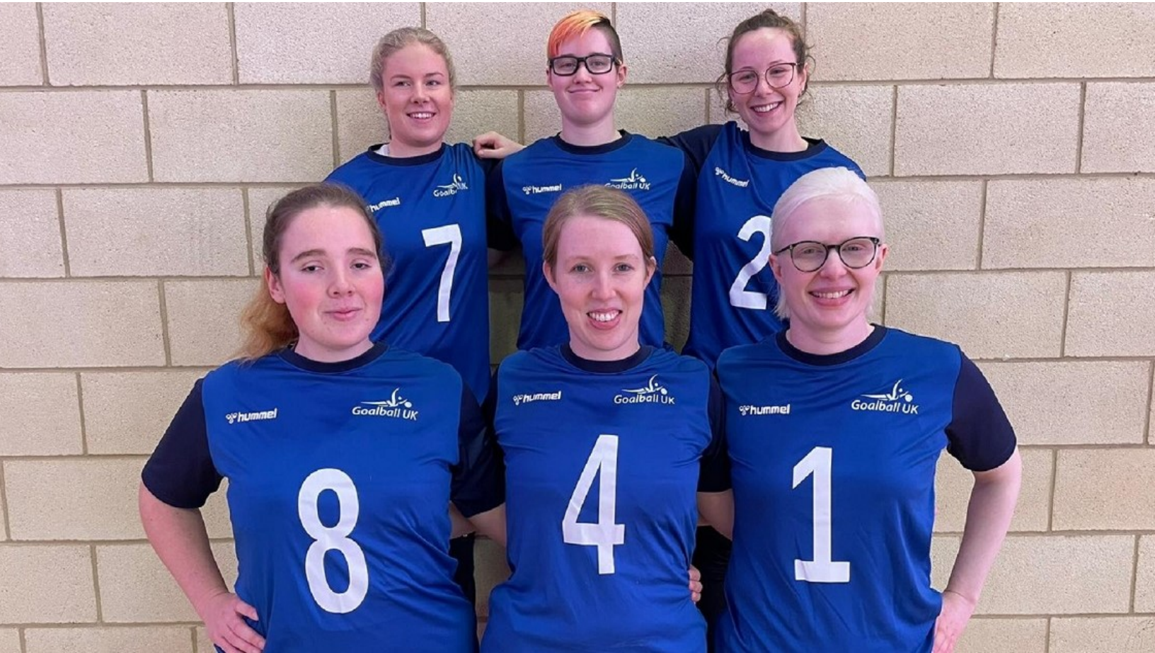
Great Britain's team for the Goalball World Championships.