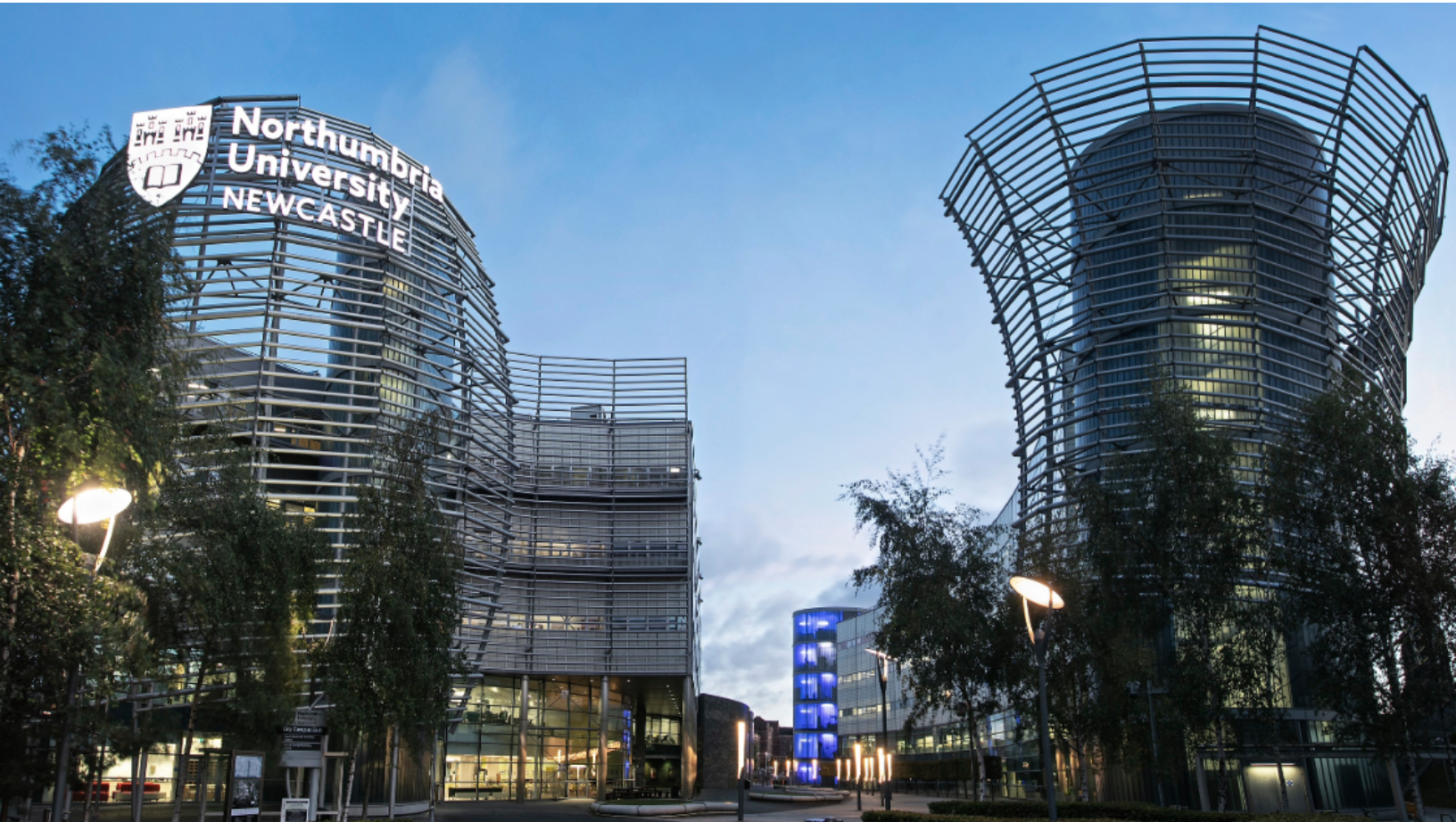
CCE City Campus Northumbria University