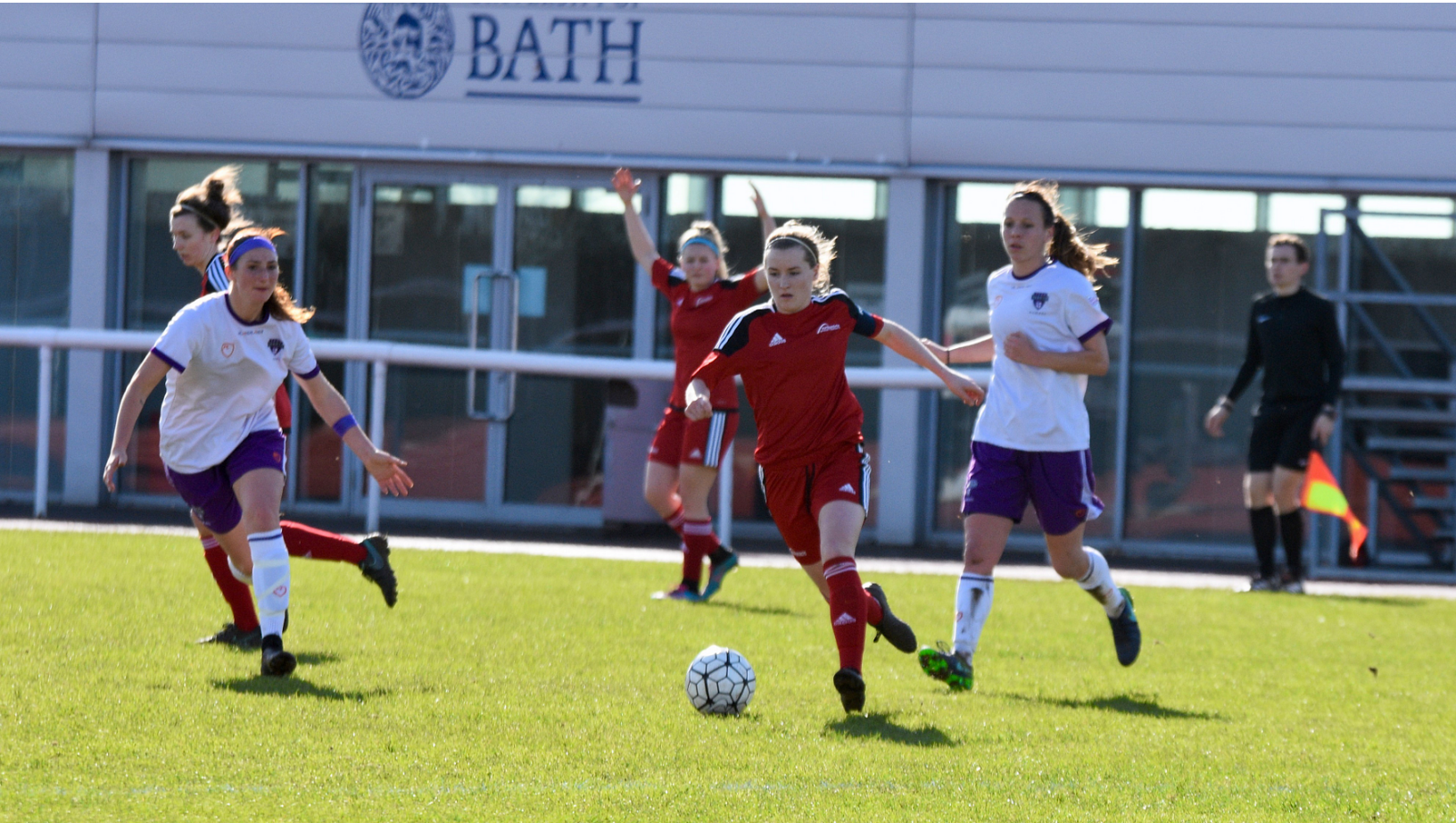
Northumbria University Women's Football Team on the ball