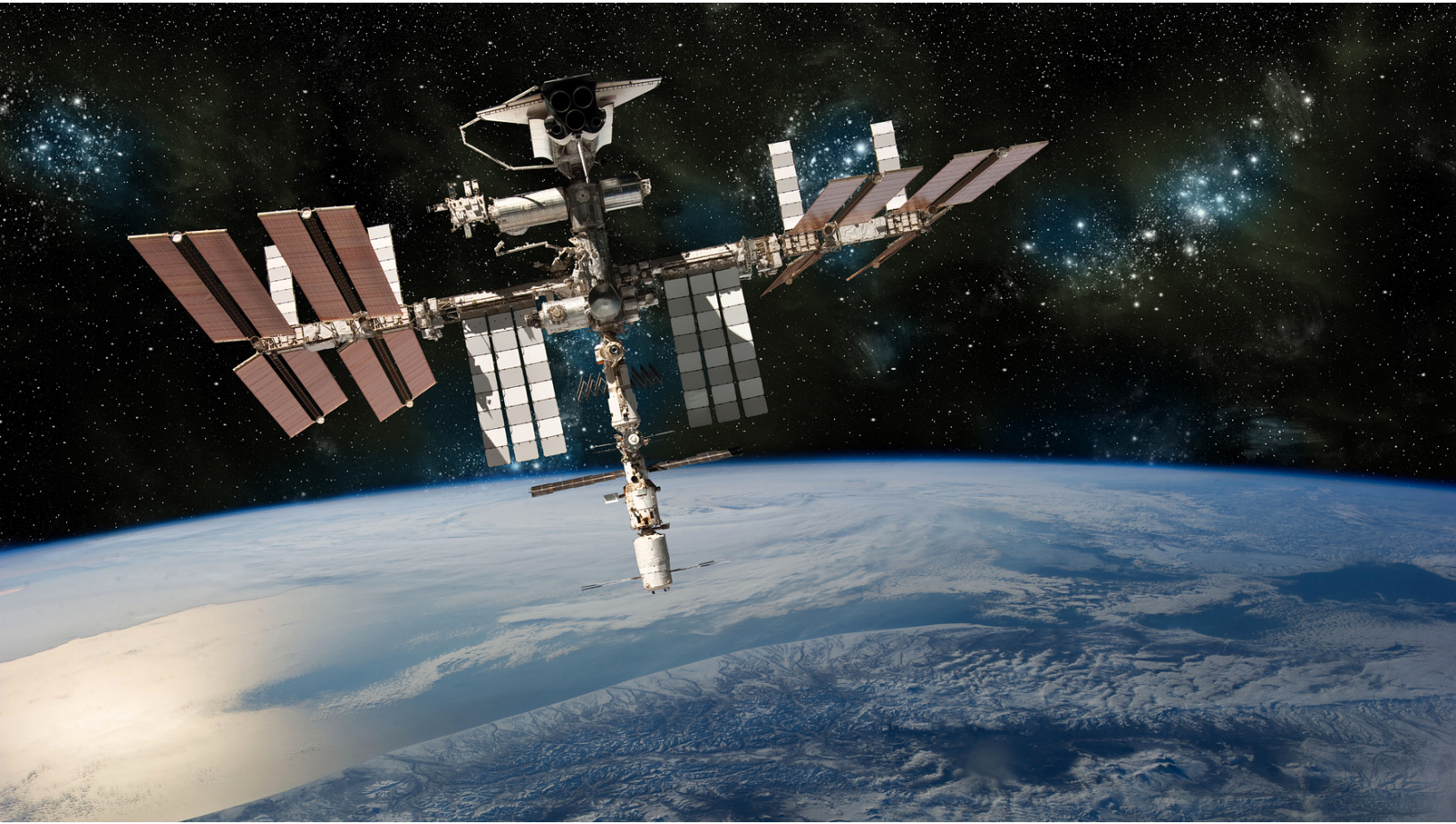
The International Space Station (ISS)