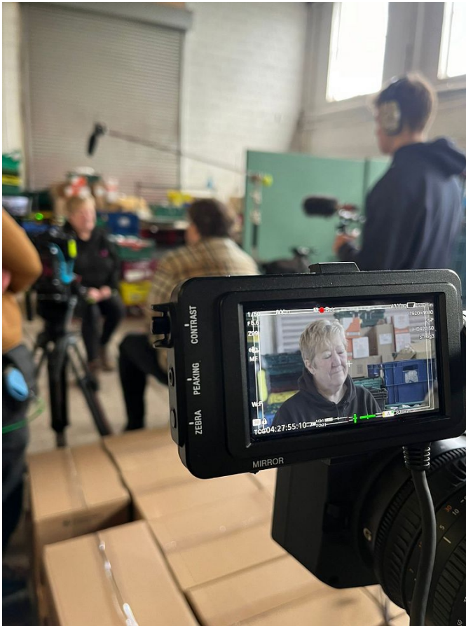
Northumbria University Film and TV Production students filming with Feeding Families

Film Buddy equip Northumbria students with the knowledge and skills required to be professional filmmakers after graduation, which includes how to navigate sensitive topics and situations.