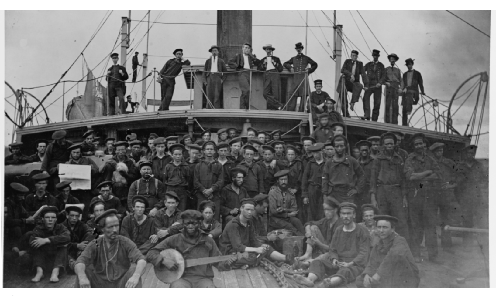
Civil war Bluejackets