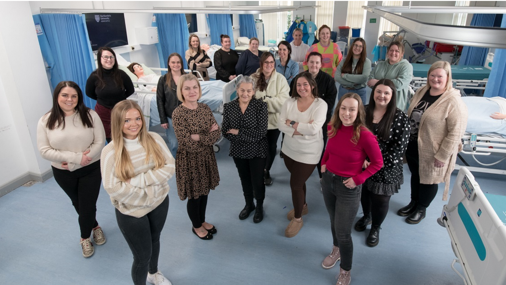
Graduating cohort of registered nurse degree apprentices 2024.