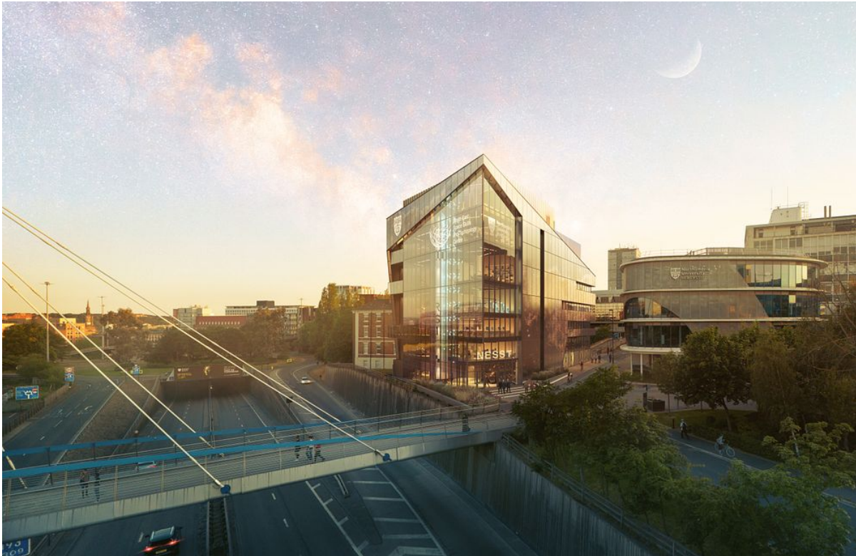
Artist's impression of the NESST building currently under construction at Northumbria's city campus in Newcastle

Described as a “game-changer” for the UK space economy, NESST will bring together industry and academia to collaborate on internationally significant space research and technological developments from its base on Northumbria's city campus in Newcastle.