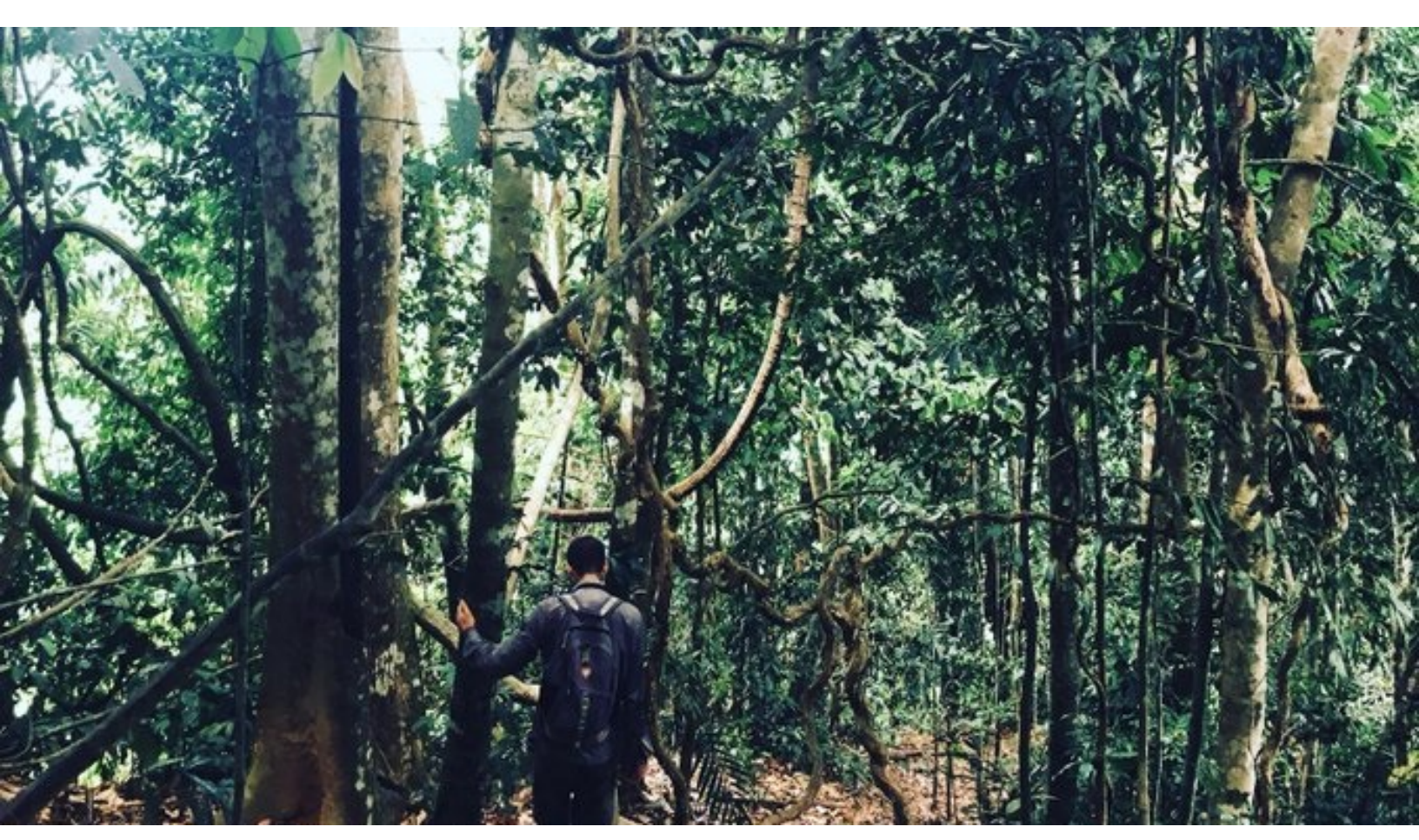
Conducting a Forest Integrity Assessment in Malaysian Borneo