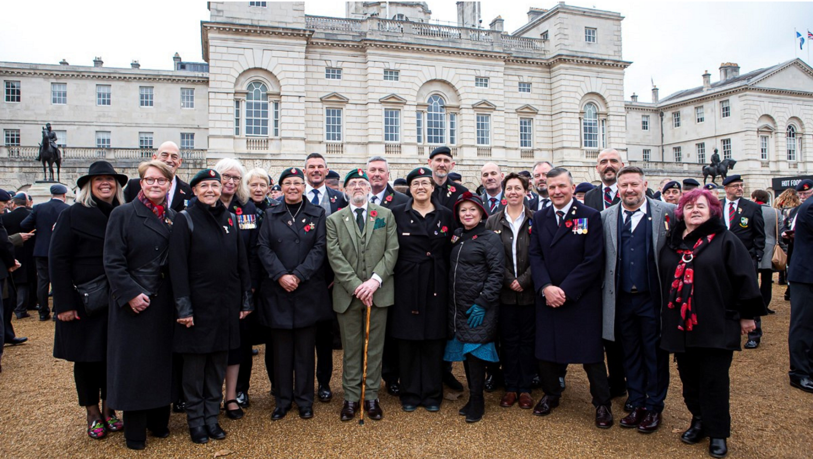
LGBT+ veterans after their first ever march past the Cenotaph in 2021