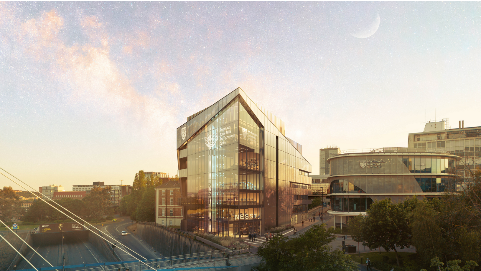
North East Space Skills and Technology Centre - initial artist's impression