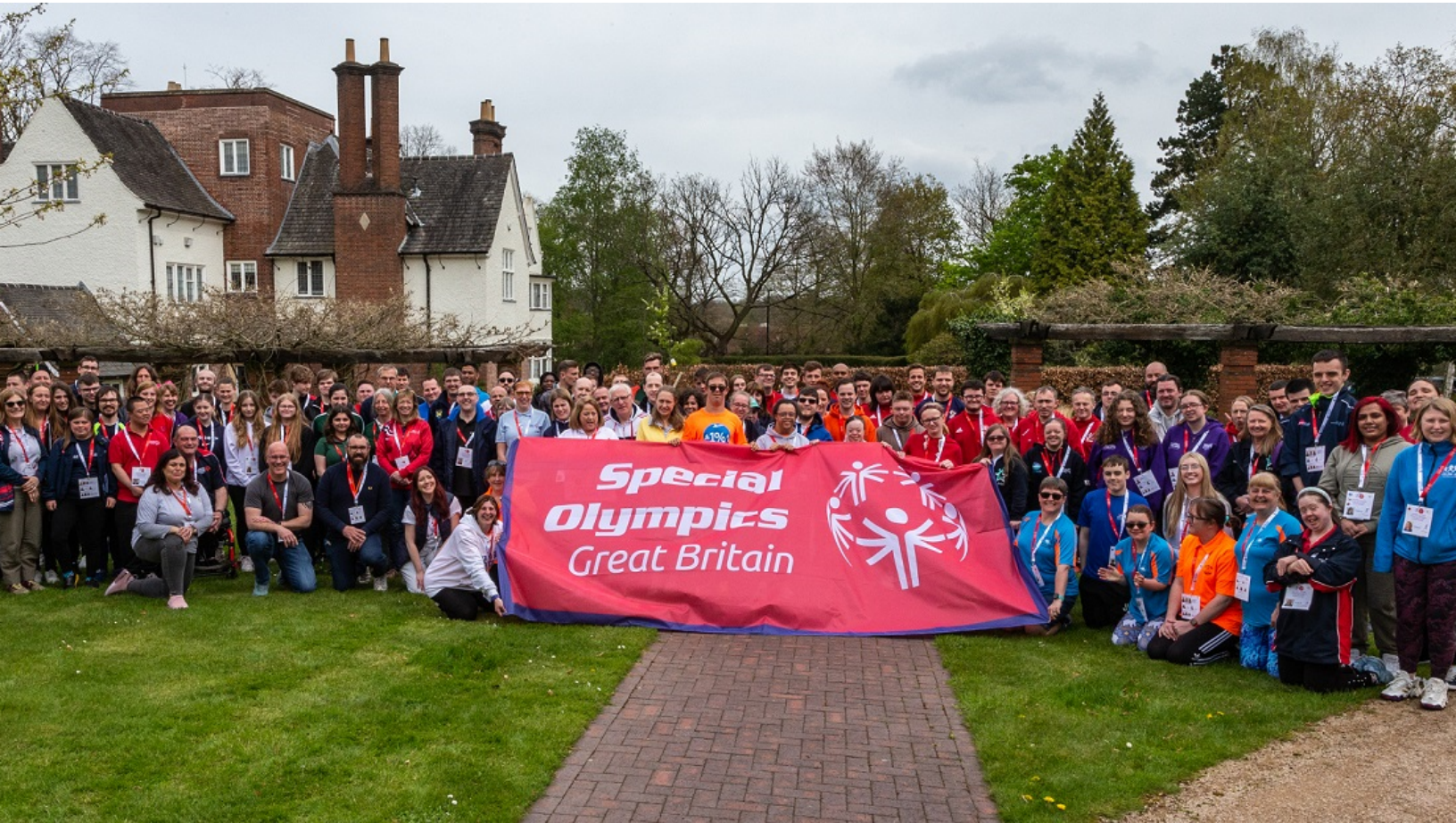
Team Great Britain ready for the upcoming Special Olympic World Games in Berlin.