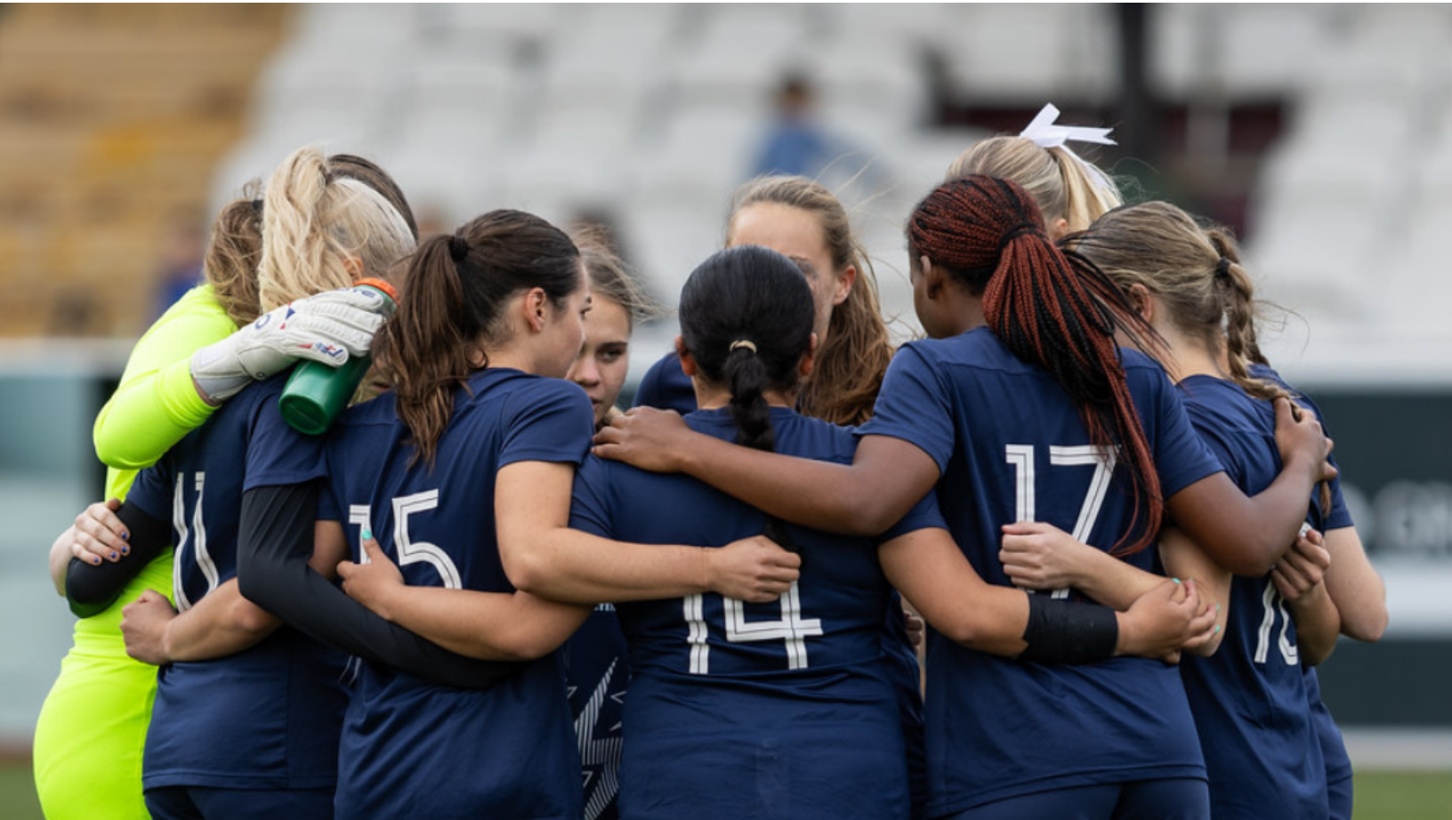
Northumbria's i2i International Soccer Academy's women's football team