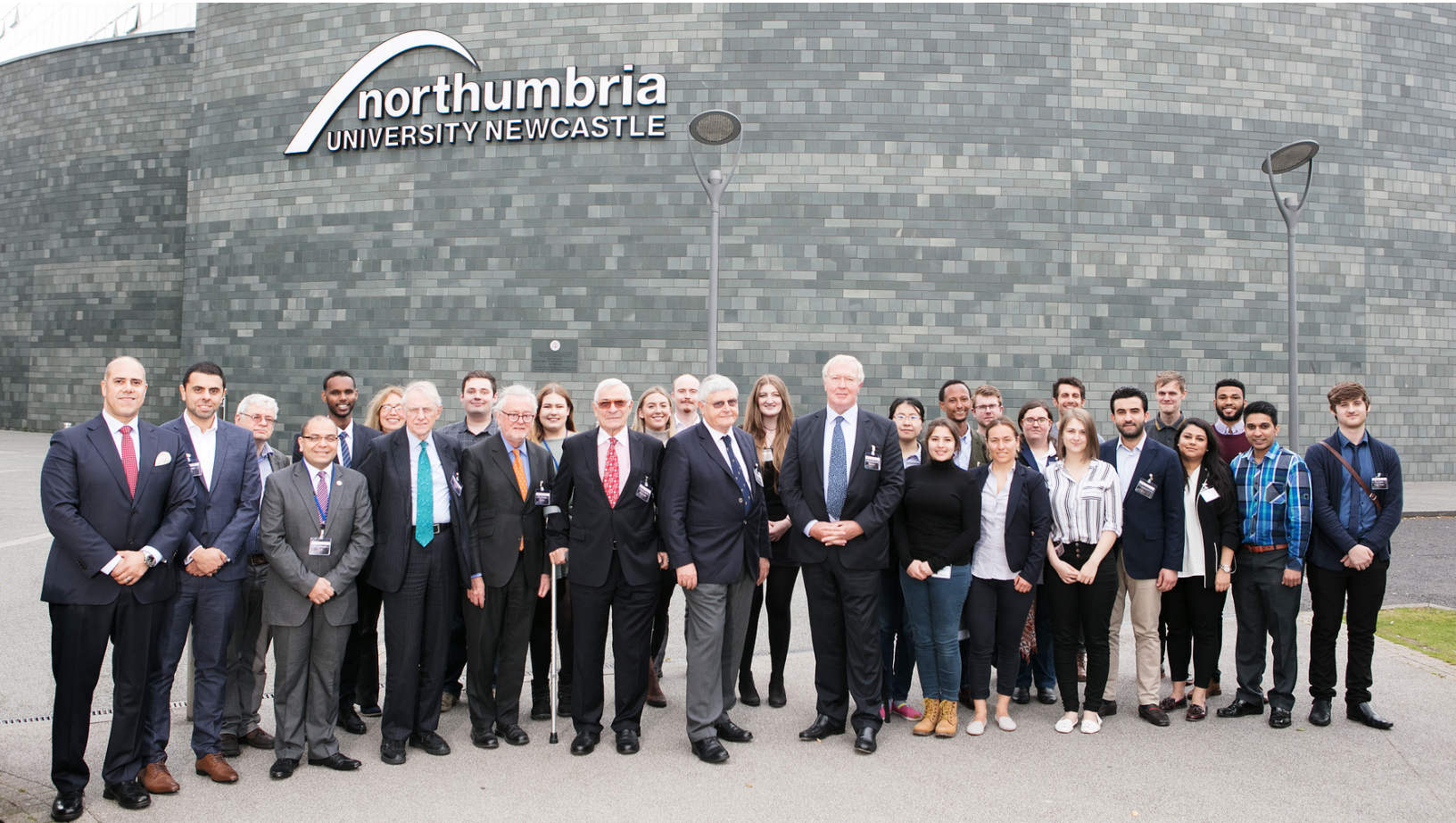
Academics from around the world gather at Northumbria for the Summer Academy