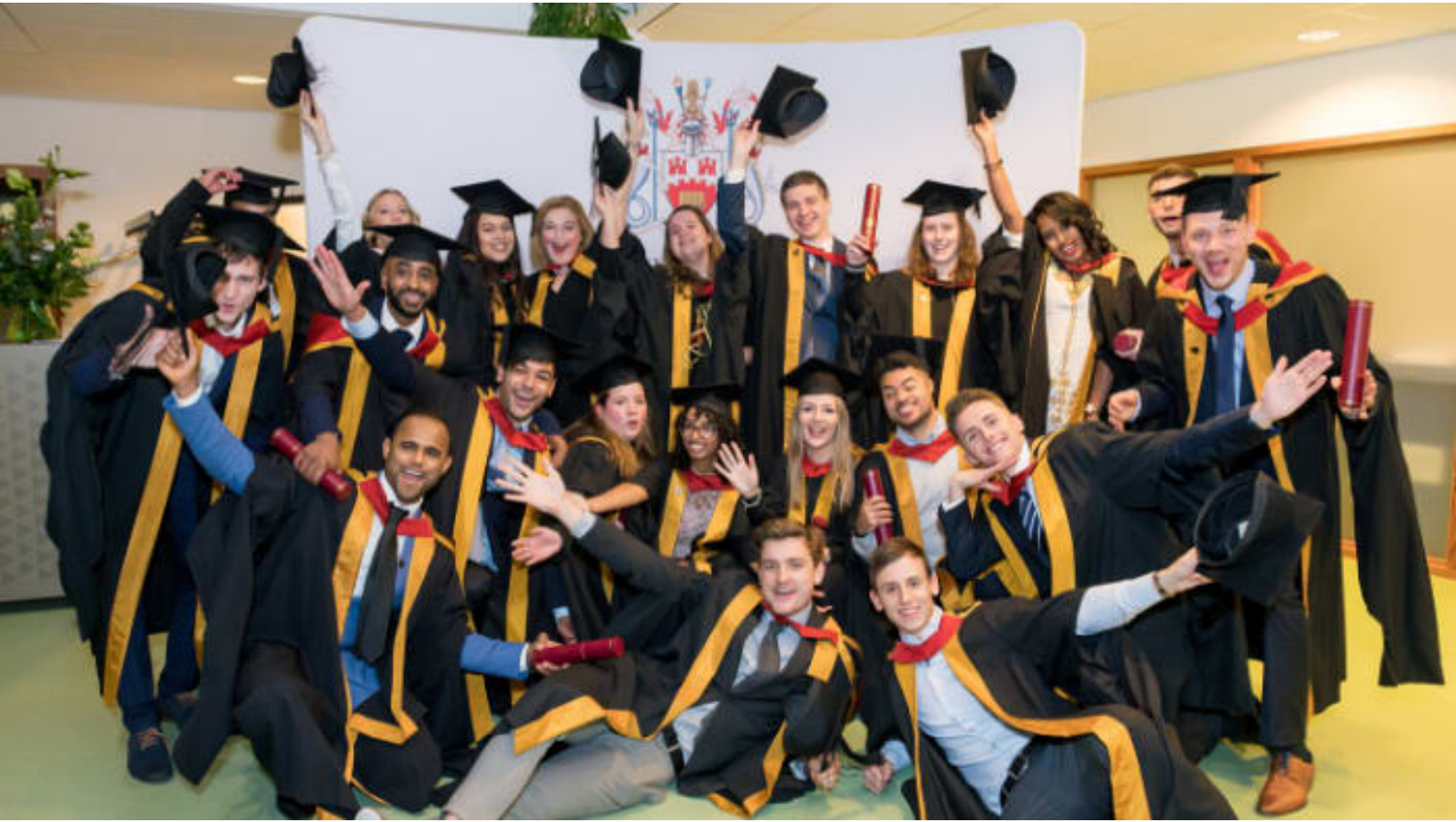
Northumbria University's first graduation ceremony in Amsterdam