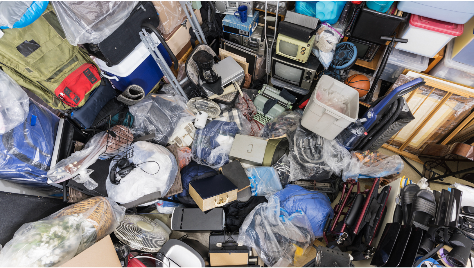
An example of a cluttered home due to hoarding