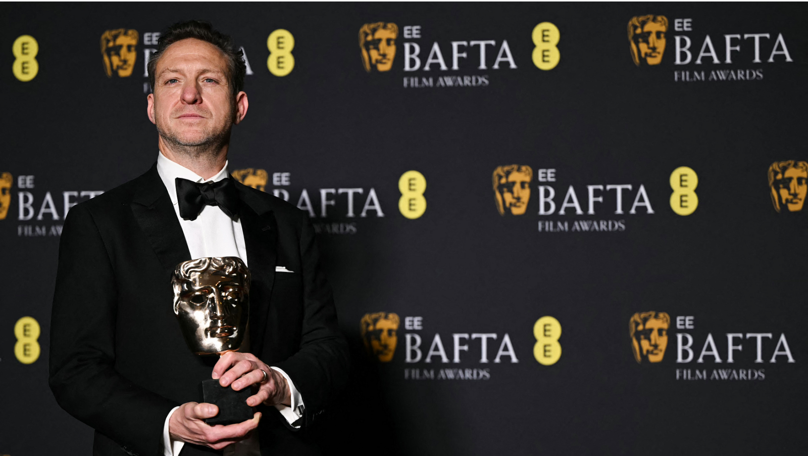
Lol Crawley at the Bafta Awards