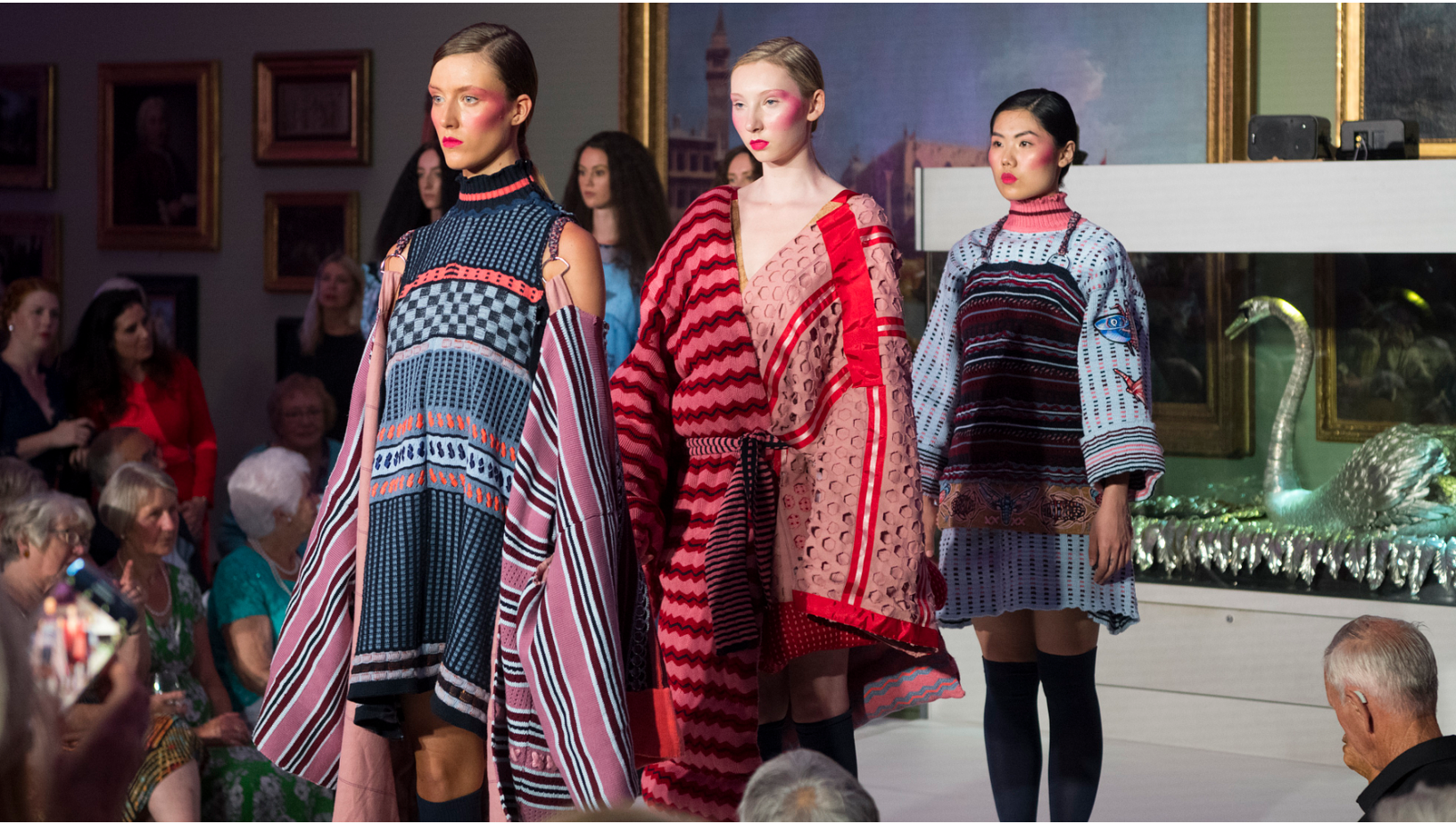
Designs by Northumbria University Fashion graduates on show at The Bowes Museum