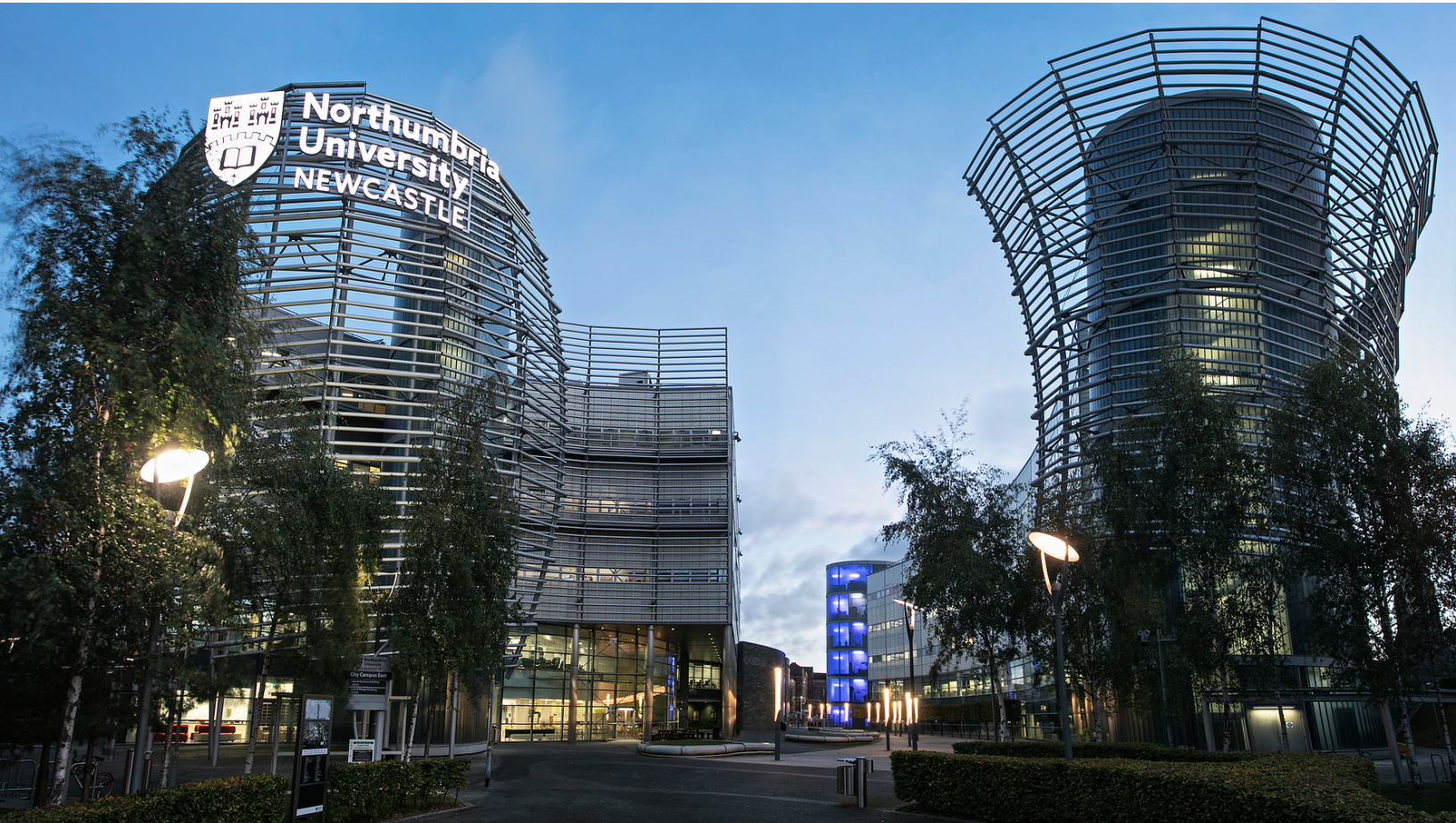
Newcastle Business School