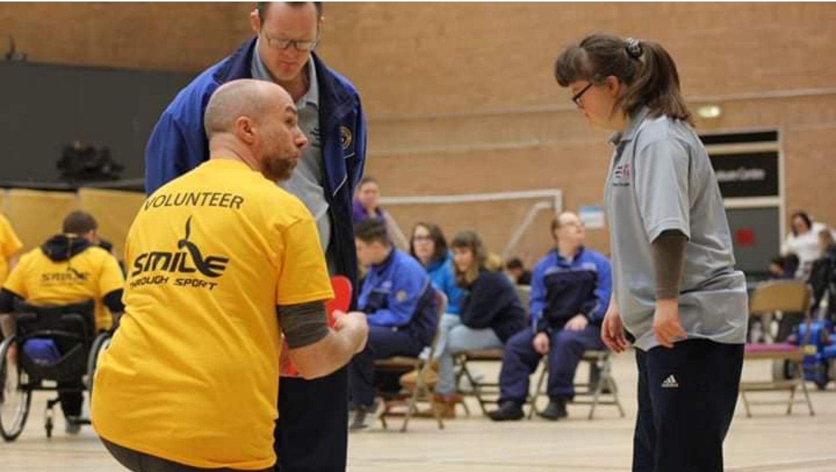
One of SMILE Through Sport's previous Boccia Opens