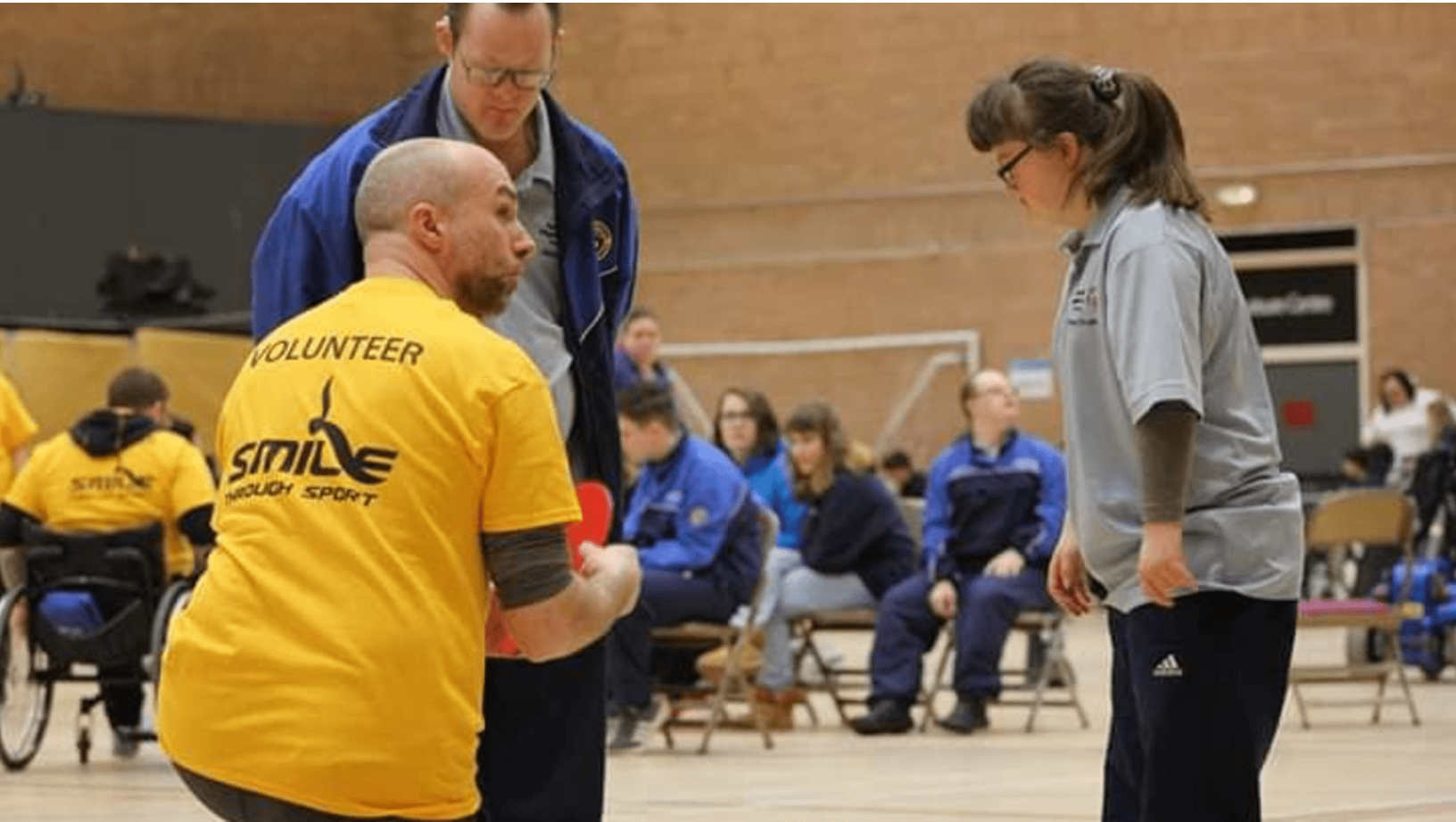
One of SMILE Through Sport's previous Boccia Opens