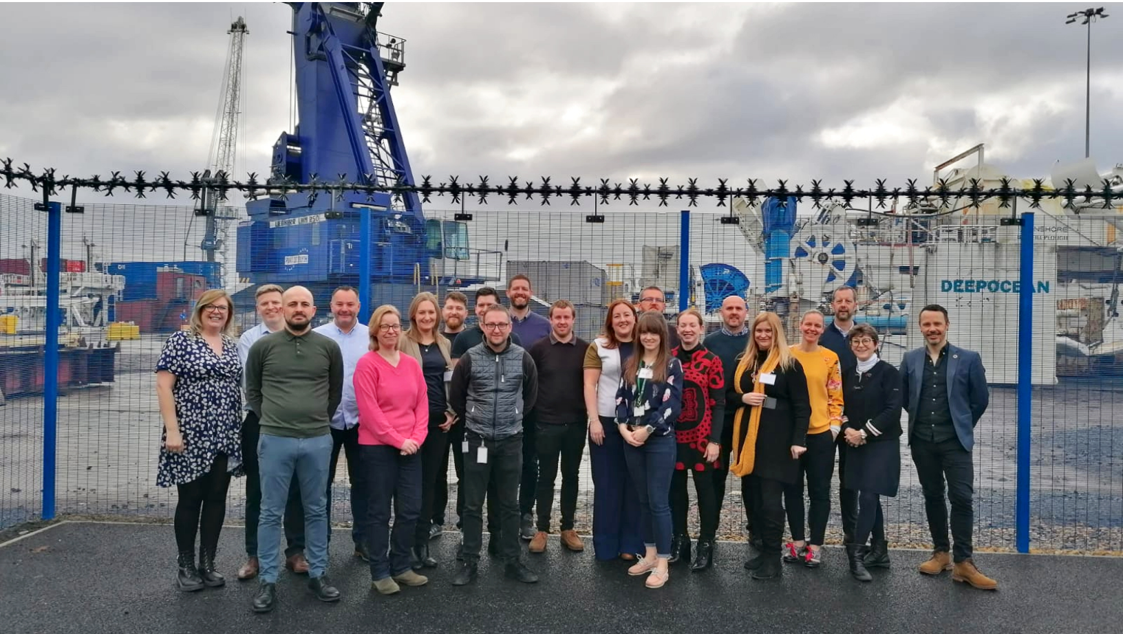
Mini-Exec MBA Workshop at Port of Blyth