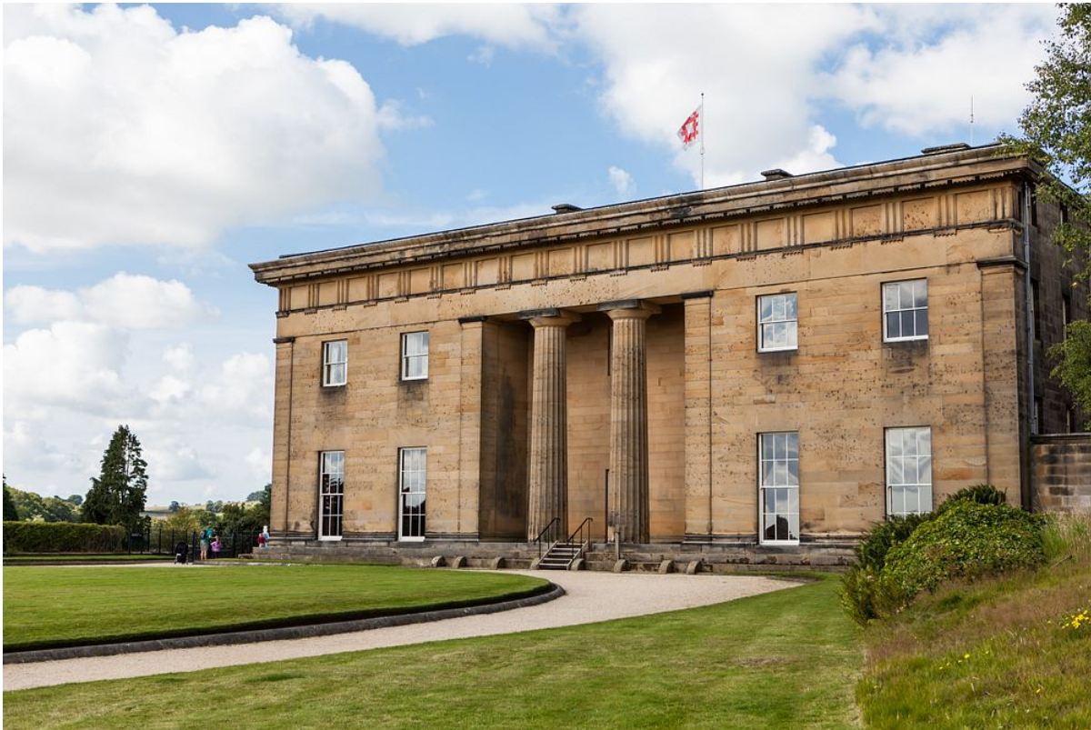
Belsay Hall.