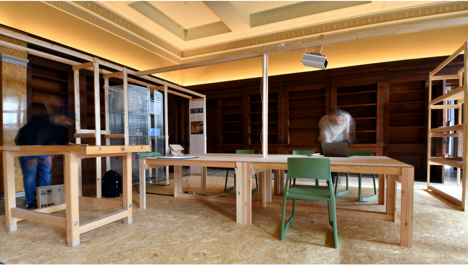
The Make and Mend pop-up studio in use at Belsay Hall.