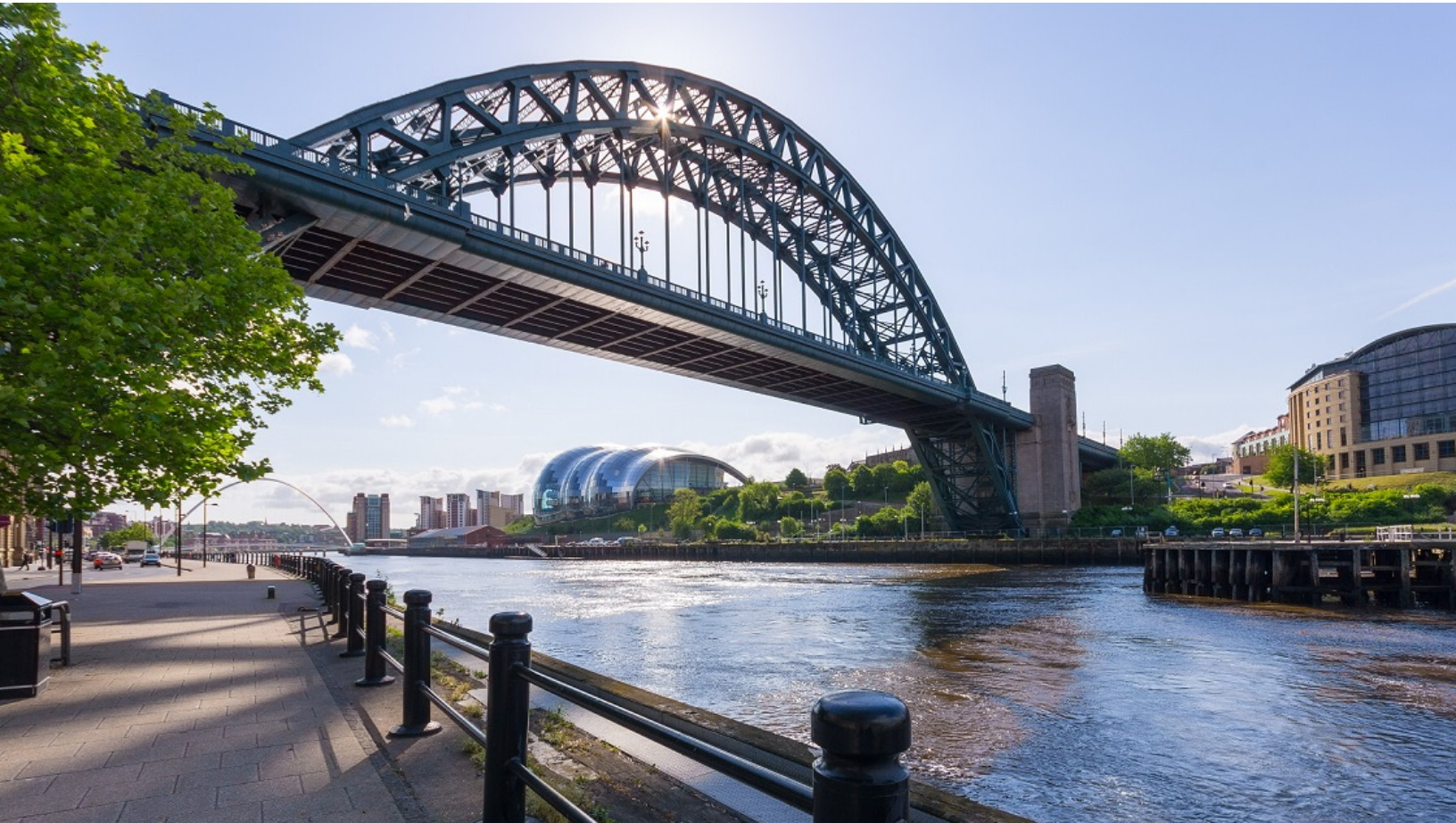
The Tyne Bridge, Newcastle