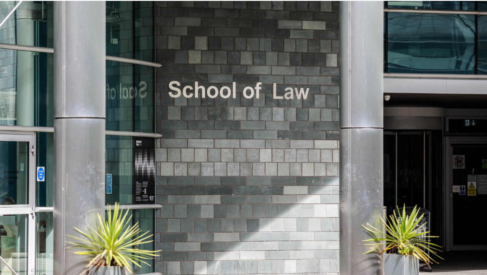
School of Law, Northumbria University