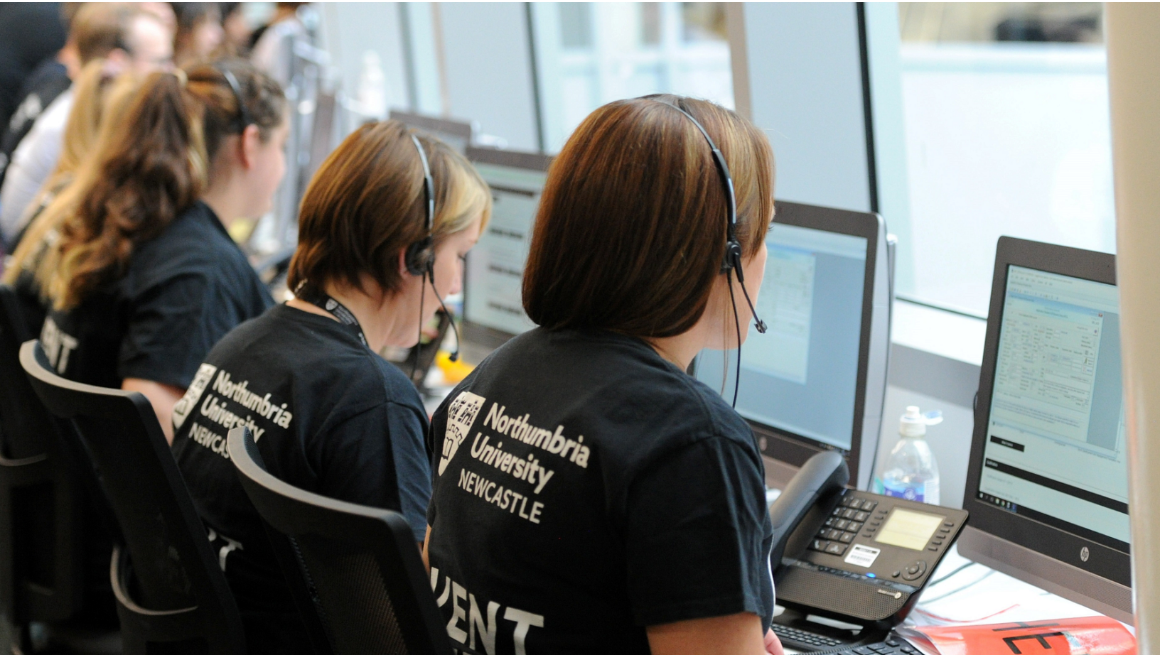
Members of Northumbria University's Clearing hotline team