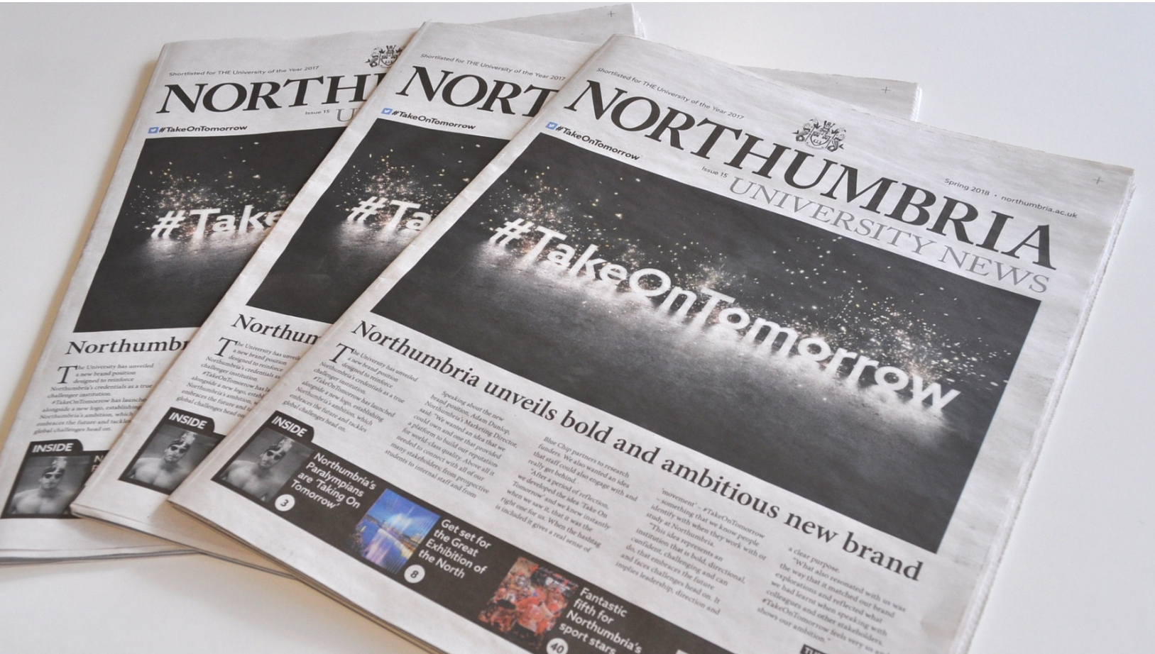
The latest edition of Northumbria University News