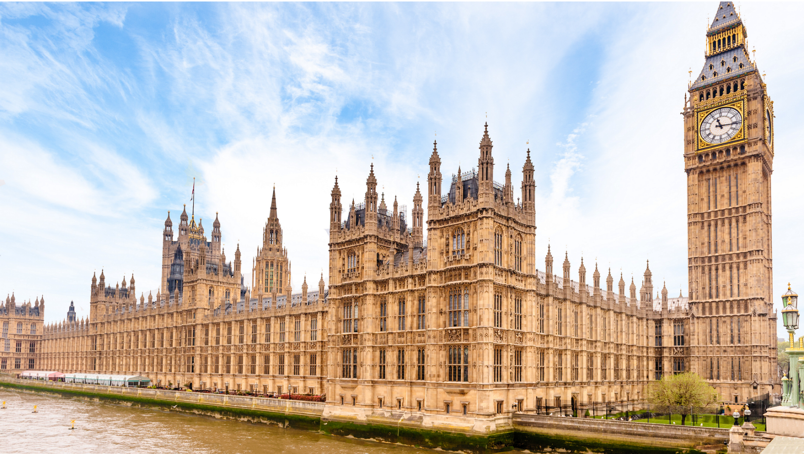
House of Commons