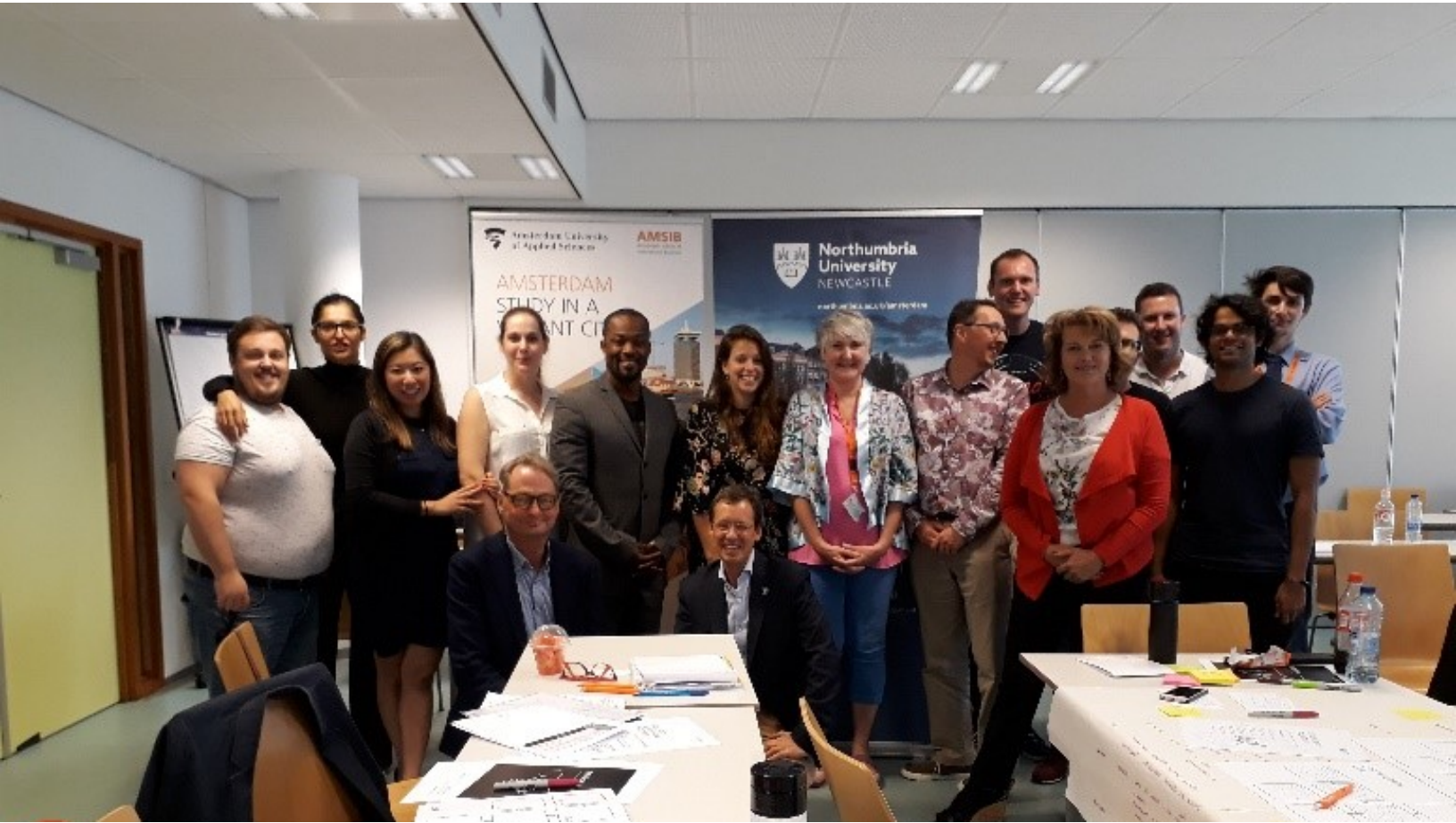
Northumbria's first cohort of MBA students in Amsterdam