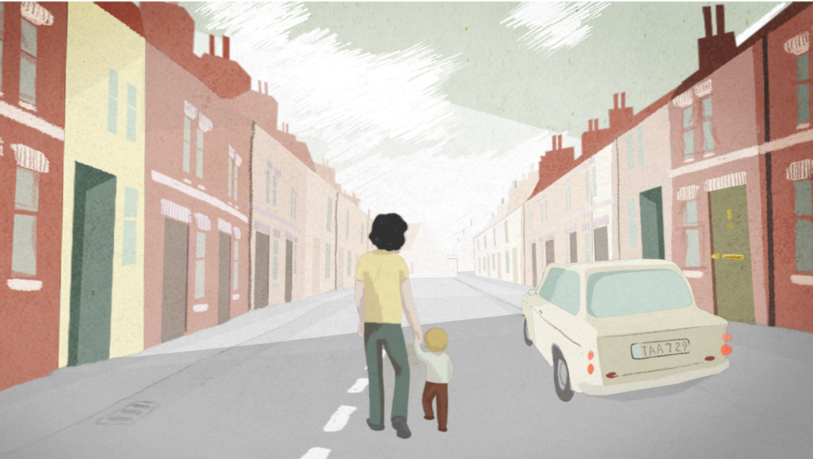
Animation from the film Irene's Ghost